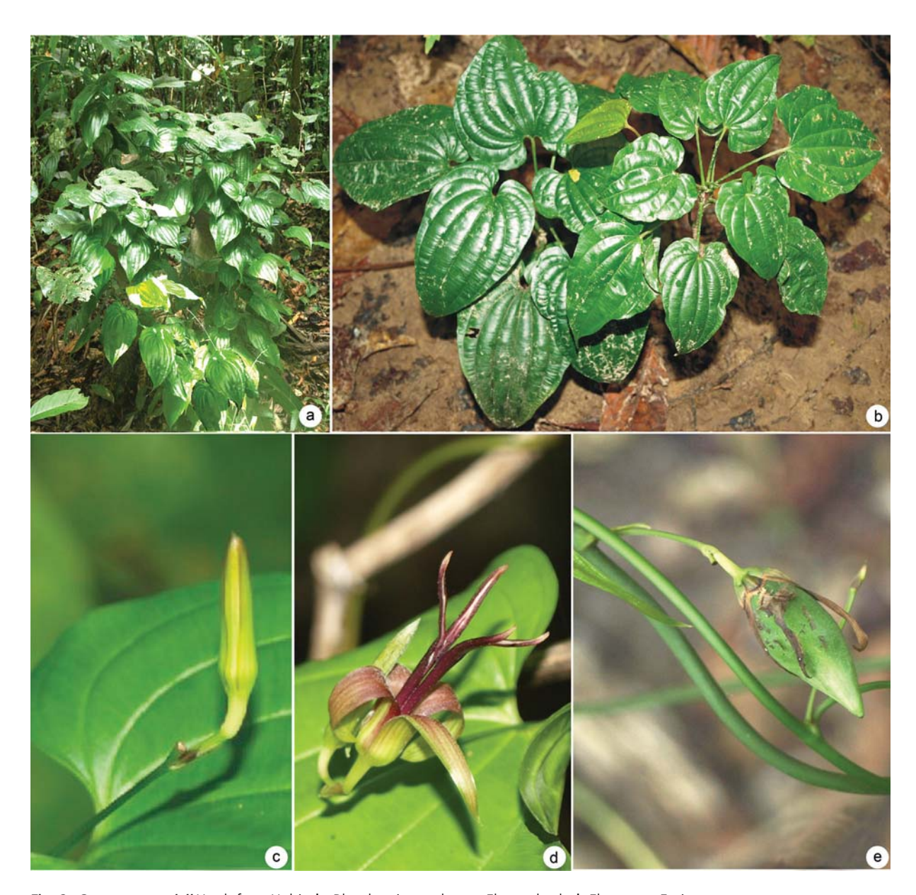
Fig. 2. Stemona curtisii Hook.f.: a. Habit; b. Plantlets in garden; c. Flower bud; d. Flower; e. Fruit

to Tengu, 1.11.2009, c. 10 m, C. Murugan 27848; School Point, c. 10 m, 3.11.2009, C. Murugan 27886; Pulopanja, stream side, c. 50 m, 12.4.2010, C. Murugan 28125; Anula, c. 10 m, 14.4.2010, C. Murugan 28158 (PBL). PENANG, Waterfall, s. die, Curtis 1522 (Holotype, photo!, K).