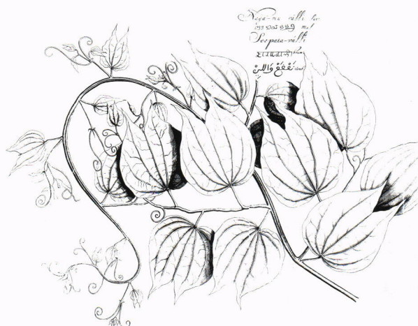
Figure 1 : Naga-mu-Valli in Rheede, Hort. Malab. 8: t. 30. 1688

Bauhinia scandens L. , Sp. Pl. 1: 374. 1753. LT: Naga-mu-Valli in Rheede, Hort. Malab. 8: 57, t. 30. 1688, designated by Nicolson et al. (1988: 123).