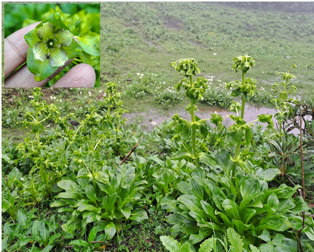
Fig. 3. Habitat of Swertia pseudohookeri Harry Sm. near Panga Teng Tso lake; Insect top view of flower.

Notes: This species is endemic to the central and eastern Himalayas, displaying distinctive characters such as an erect, perennial herbaceous habit, cymose inflorescence, large greenish-white purple-striped corollas and rhomboidal or oval nectaries with raised fimbriae surrounding the small adaxial opening of the nectaries. Notably, the presence of fimbriae is a feature shared with Swertia splendens , which also is found in Arunachal Pradesh. However, S. pseudohookeri can be easily distinguished from S. splendens , by its ovate leaves ( vs. spatulate to obovate), green stems ( vs. brick red), greenish-white and purple-striped flowers ( vs. brick red, when drying yellow-green) and nectary with long fimbriae ( vs. short) (Fig. 4a). Another species, S. grandiflora , has been sighted in two localities, Se La and Bangajaan, and was first documented in India in 2020 (Bharali et al. , 2018; Liden & Bharali, 2020). S. pseudohookeri