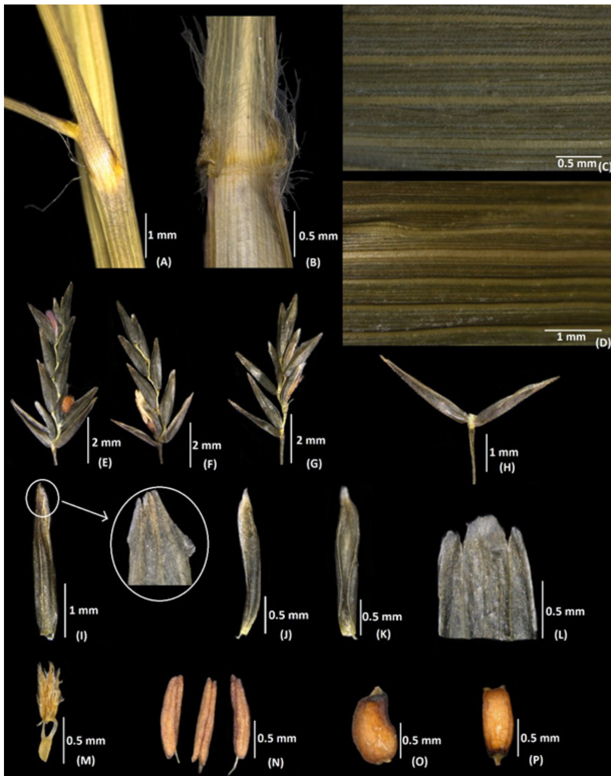
Fig. 2. Eragrostis trichodes (Nutt.) Alph.Wood: a. Axil of panicle; b. Junction of leaf sheath and blade—adaxial view; c. Leaf blade—adaxial view; d. Leaf blade—abaxial view; e-g. Spikelets; h. Removed glumes—lateral view; i. Lemma—lateral view; j. Palea—lateral view; k. Palea—dorsal view; l. Upper half of palea; m. Ovary with feathery stigma; n. Anthers; o. Caryopsis—lateral view; p. Caryopsis—adaxial view (from D. Prasad 350004).

elliptic, apex truncate). E. trichodes is also allied to E. nigra Steud., with glumes lanceolate-acuminate and a similar length of the lemma, but has lower glume