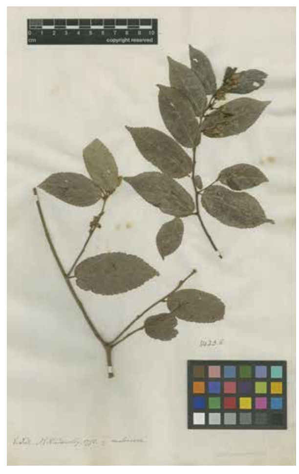
Fig. 1 . Lectotype of Grewia columnaris Sm. (LINN-HS1423-8). https://plants.jstor.org/stable/10.5555/al.ap. specimen.linn-hs1423-8

a question mark (in pencil) which indicates the uncertainty about its identity.