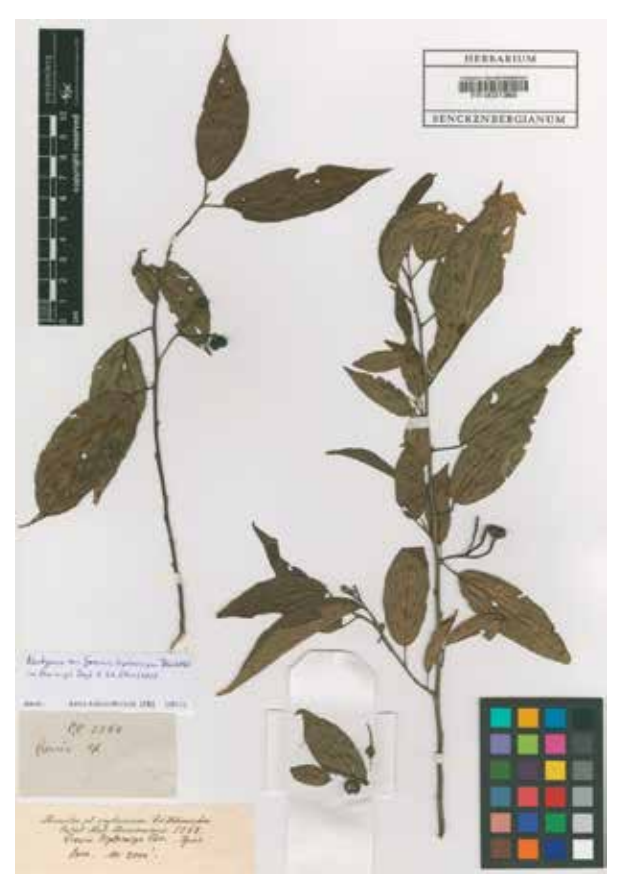
Fig 5. Lectotype of Grewia diplocarpa Thwaites (FR0031365). https://plants.jstor.org/stable/10.5555/al.ap. specimen.fr0031365

Thwaites (1858) in the protologue of G. diplocarpa cited 'C.P. [Ceylon Plants] 2568' along with the habitat 'Maturatte and Oova, at elevations of about 3000 feet'. Majority of the Ceylon collections of Thwaites are deposited at K and PDA and rest are distributed in various other Herbaria (Stafleu & Cowan, 1986). Authors could locate two relevant specimens at G (G00357051, G00357052), one each at P (P6605101) and FR (FR0031365). These