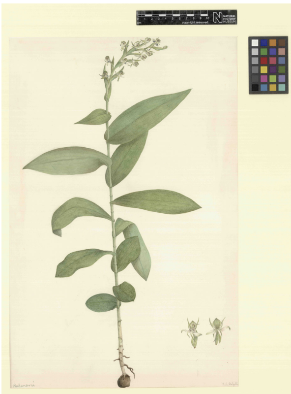
Fig. 6. Neotype of Habenaria laciniata Dalzell (Drawings from Dalzell's collection at BM). Nicholas Alexander Dalzell (1817–1878) collection of watercolour and outline drawings of plants.

Habenaria ovalifolia Wight, Icon. Pl. Ind. Orient. 5: 13, t. 1708. 1851, syn. nov. Lectotype (designated here): INDIA, Tamil Nadu, Annamalai (as Annamalay), July 1848, R. Wight s.n. (K [K000247463!]). Residual syntypes : INDIA, Kerala, Malabar, June 1836, R. Wight