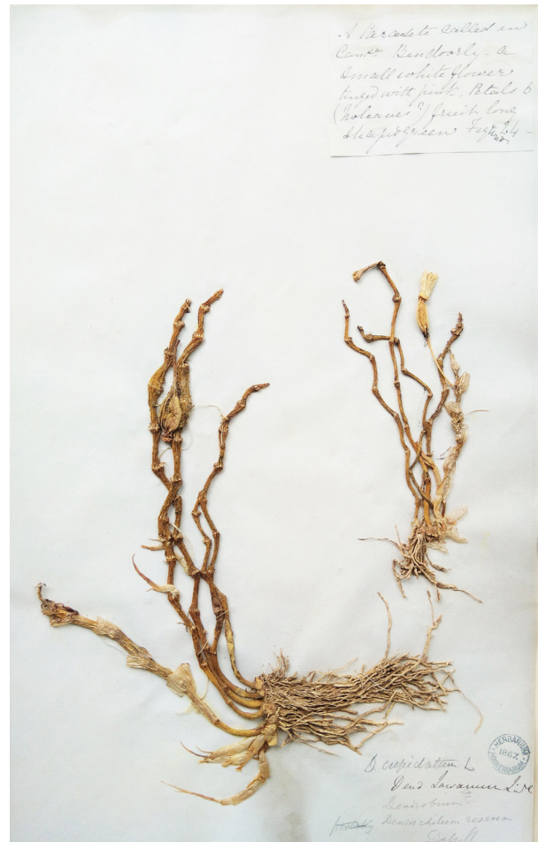
Fig. 4. Neotype of Dendrochilum roseum Dalzell (Dalzell s.n. [K]). © The Board of Trustees of the Royal Botanic Gardens, Kew, reproduced with permission.

An epiphytic orchid, endemic to peninsular India,