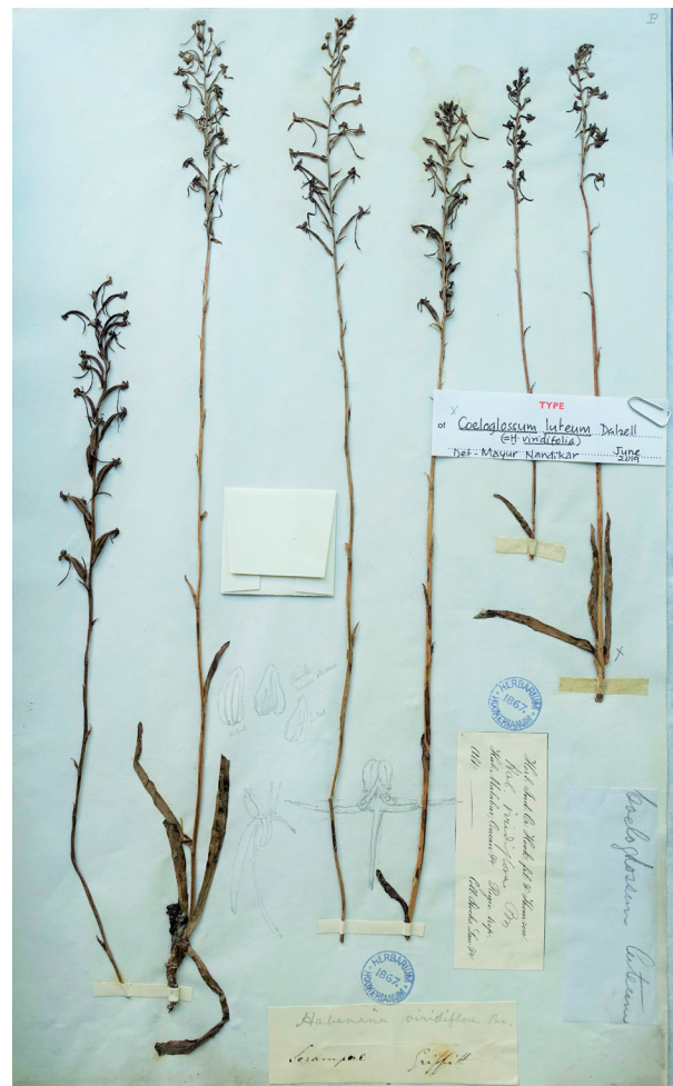
Fig. 2. Lectotype of Coeloglossum luteum Dalzell (K, specimen marked 'x').

The sheet at S (S07-289.2) is chosen here as the lectotype for Orchis viridiflora , as it is from O. Swartz's Herbarium, who described the species, and it has an annotation by Rottler, who collected the species. Rottler's collection of O. viridiflora at L (L1381.15) and C (C10016243), the former is