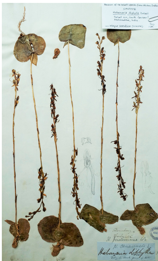
Fig. 5. Lectotype of Habenaria diphylla Dalzell (Dalzell s.n. [K]).

This terrestrial orchid is widespread in India and Southeast Asia and can be recognized in the field by its ground appressed two leaves, entire petals,