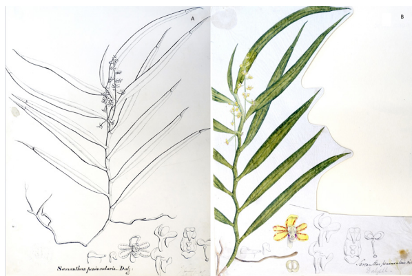
Fig. 8. Drawing of Sarcanthus peninsularis Dalzell (= Cleisostoma tenuifolium (L.) Garay) at Kew: a. An ink drawing available through ‘Icones Stocks’; b. Water colour drawing (perhaps corresponded by Dalzell to Hooker) exactly similar to the preceding with Dalzell’s own ink label.

We could locate three sheets and two drawings of Sarcanthus peninsularis housed at K and GH. The sheet K000942275 has been labelled by Dalzell as ‘ Sarcanthus peninsularis mihi...’ It also has pencil illustrations of flower parts. The remaining sheet at K is not digitized yet, and it has Stocks’ label ‘Orchideae no. 35’. A sheet from Harvard (GH00103899) has Dalzell’s label in the