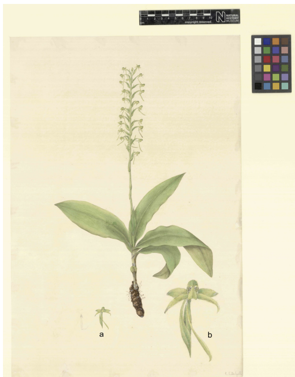
Fig. 7. Neotype of Habenaria modesta Dalzell (Drawings from Dalzell's collection at BM), 'a' flower; 'b' enlarged and edited flower to show incurved lip mid-lobe. Nicholas Alexander Dalzell (1817–1878) collection of watercolour and outline drawings of plants. [Public domain. From the Library and Archives, Natural History Museum, London].

Habenaria ovalifolia Wight has been reduced to the synonymy of H. furcifera Lindl. (Fig. 3f) (POWO 2023) which is corrected here and considered conspecific to H. modesta . Habenaria furcifera has longer filiform lateral lip lobes, broader mid-lobe free from galea, and hamate spur as opposed to sub-equal lip lobes, whereas H. modesta has linear-lanceolate acute lateral lobes, an ovate-oblong mid-lobe coherent with galea and a filiform faintly