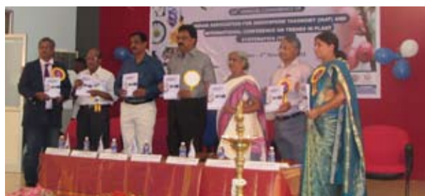
The release of Souvenir and Abstract volume