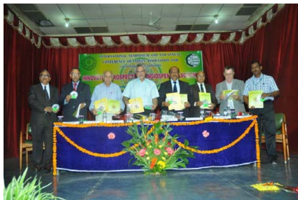
Release of Abstracts and Souvenir volumes