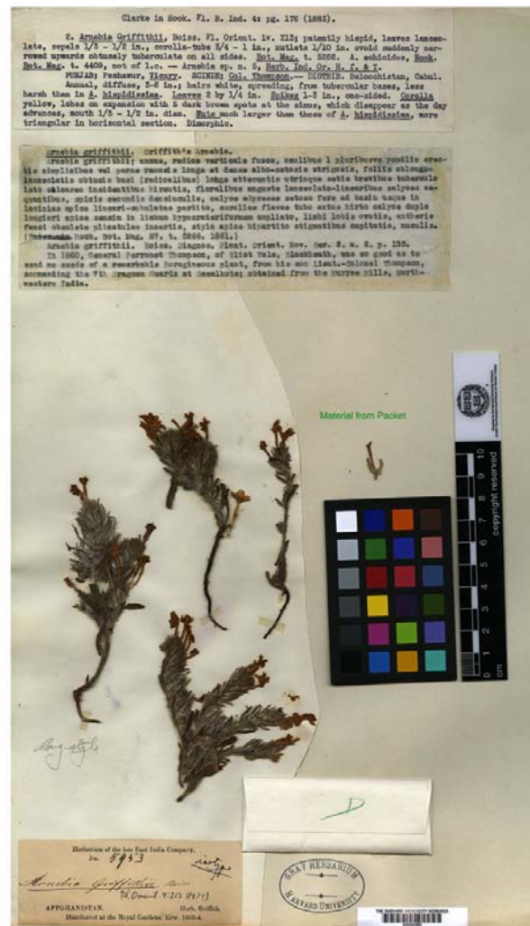
Fig. 2. Arnebia griffithii Boiss.