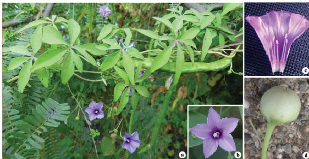
Fig. 1. Ipomoea tenuipes Verdc.: a. Habit; b. Single flower; c. Corolla split open showing stamens; d. Fruit.

Habitat & Ecology: Grows along road sides, usually in black cottony or loamy soil. It mostly twines on bushes of Prosopis juliflora DC.